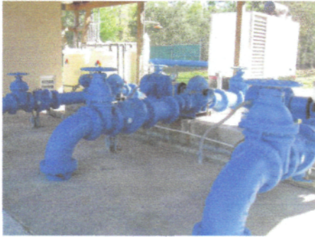
Part of the new water system at Sugarmill Woods plant #2

New high pressure pumps will ensure better water pressure for the residents of Sugarmill Woods and Chassahowitzka.